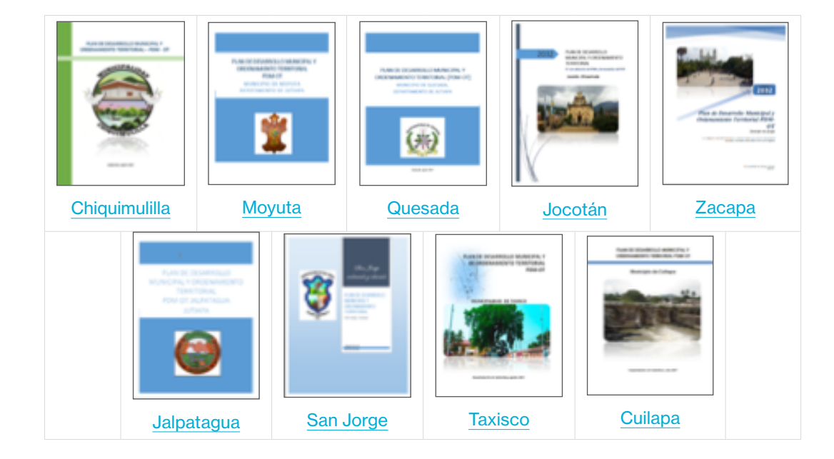
Figure 2.1 Guatemala's municipal development and land management plans

The poverty-environment nexus was used in the elaboration of nine municipal development and land management plans in Guatemala (Figure 2.1) as well as a